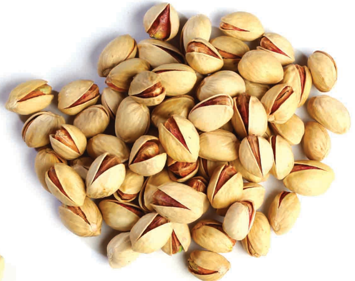
Pistachio Round (Fandoghi)