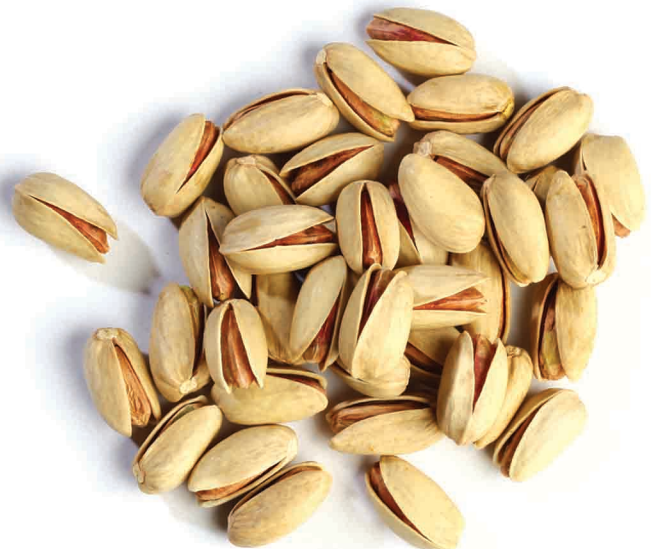
Pistachio Long (Akbari)