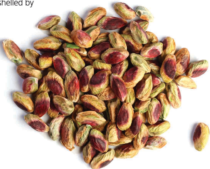
Natural Pistachio Kernels "Ahmad aghaie"

In order to maintain freshness and healthiness of product, we use closed-mouth pistachios and after they are shelled by machinery, we remove foreign materials and pack them in 10 kg vacuum bags. Most available varieties are "Round (Fandoghi)" "Long (Ahmad Aghaie)" and "Red"