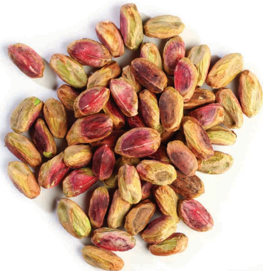
Natural Pistachio Kernels "Red"