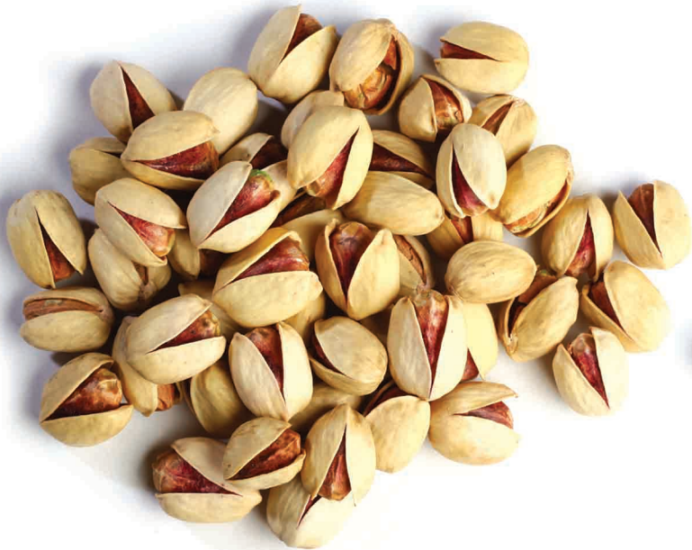
Pistachio Jumbo (Kalleh Ghouchi)