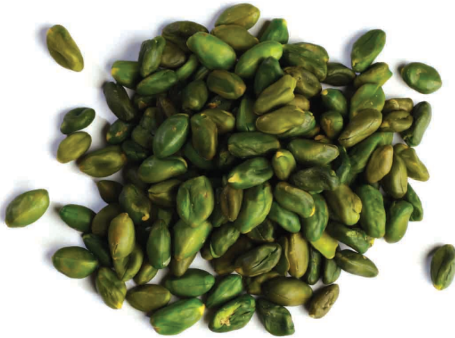
Green Peeled Pistachio Kernels

GPPK is mostly used as an ingredient in chocolates, sausages, ice-creams and pastries.