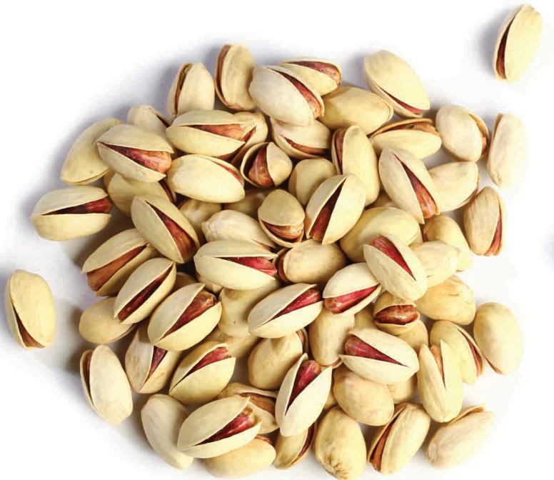
Pistachio Super Long (Ahmad Aghaei)